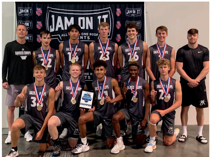
The Sacred Hoops Basketball AAU West Coast National Championship Team.

“Basketball has been a part of my entire life,” he said. “I developed a love for the game. God has used it to impact my entire life, and now I’m using it to impact others.”