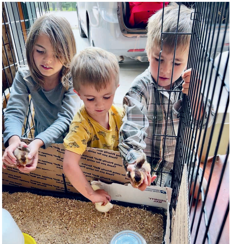
The Van Sambeek kids inspect the chicks that will be added to their coop.